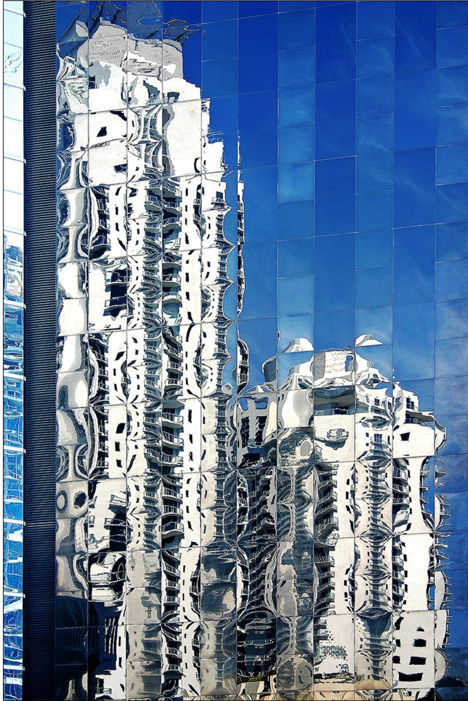
“Building Just Before a Nervous Breakdown” 2008

Digital photograph by Lorenzo Pérez Ayuela