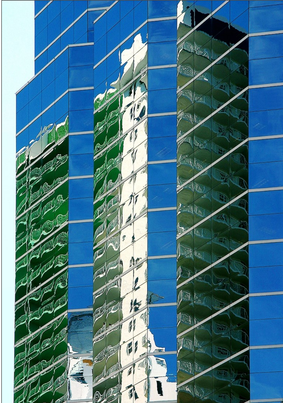
“The Three Towers” 2008