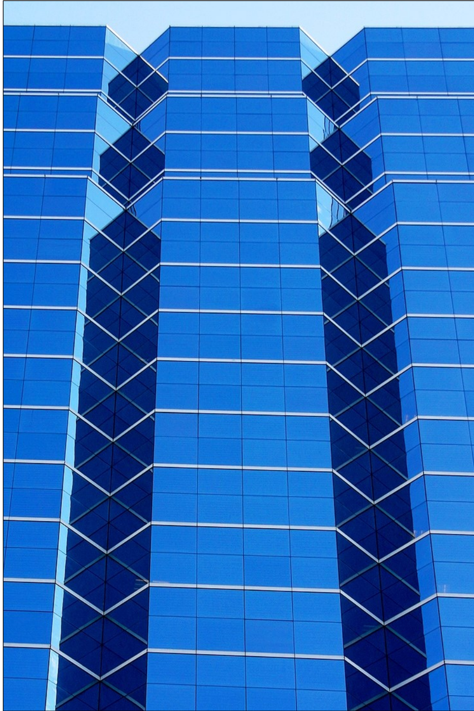
“Reflection #654” 2008

Digital photograph by Lorenzo Pérez Ayuela